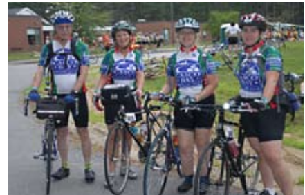
---MS Ride--- The Gang of Four