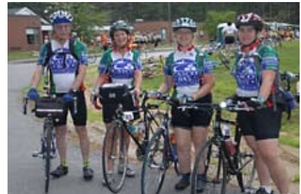
---MS Ride--- The Gang of Four